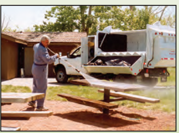
Pressure washer is ideal for outside cleaning of furniture and fixtures.