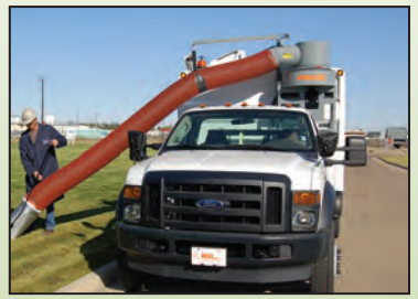
Hydraulically powered Litter Loder is a powerful vacuum and eliminates auxillary engine noise.