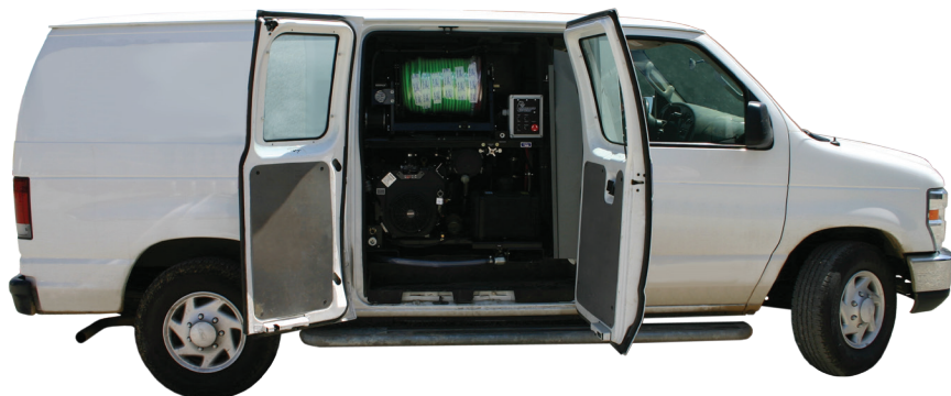
Model 123 Van Pack

Sewer Equipment's Mongoose Jetters Model 123 is one of this brand's best selling units. With reliable features such as the Mongoose Run Dry Pump at 12 gpm @ 3000 psi, tubular steel frame, corrosion resistant pre-painted sub assemblies, state of the art controls, strong hose reel and high quality gas engine, this machine will return more on your investment than anything in its class.