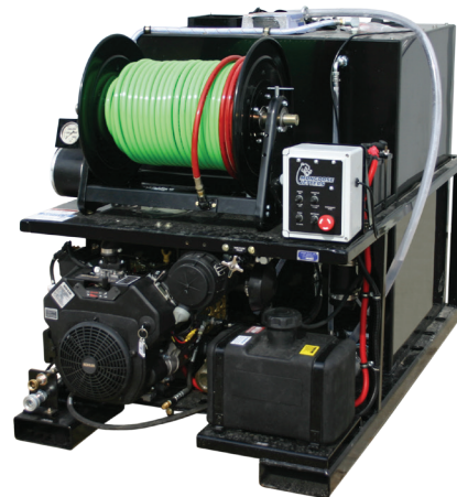
Model 123 Van Pack